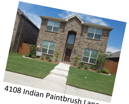
4108 Indian Paintbrush Lane