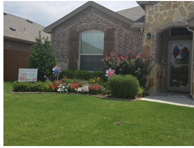
2130 Blakehill Drive