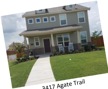
3417 Agate Trail