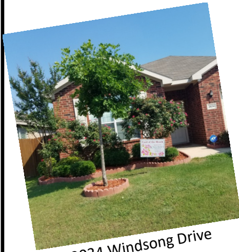
2034 Windsong Drive