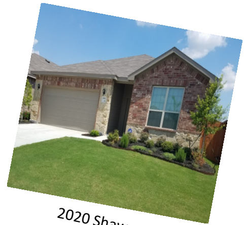
2020 Shawnee Trail