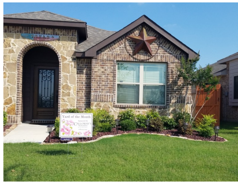
4086 Serene Drive