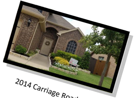
2014 Carriage Road