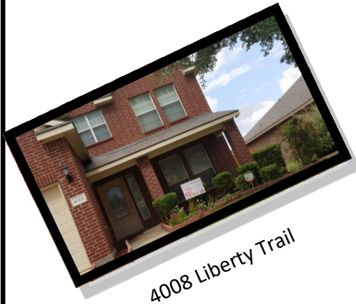
4008 Liberty Trail